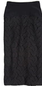
Lace Pencil Skirt Was $745.00 Now $445.00