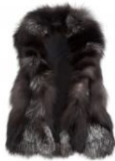
Silver Fox Sectioned Vest $1,400.00