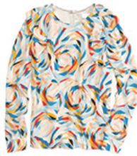
Draped Shoulders Top Was $695.00 Now $395.00