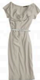
Belted Cap Sleeve Dress Was $2,295.00 Now $920.00