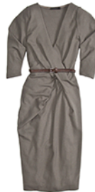
Belted Elbow Sleeve Twist Dress Was $2,495.00 Now $995.00