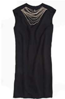
Chain Collar Dress Was $1,025.00 Now $645.00