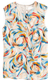
Sleeveless Draped Top Was $595.00 Now $350.00