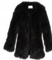
Black Knit Fox Jacket $1,600.00